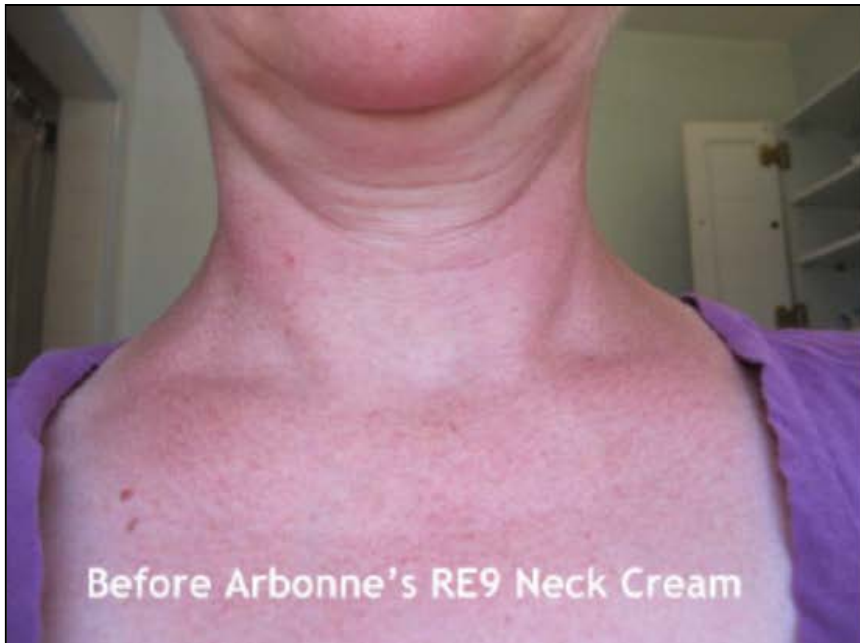
Before Arbonne's RE9 Neck Cream