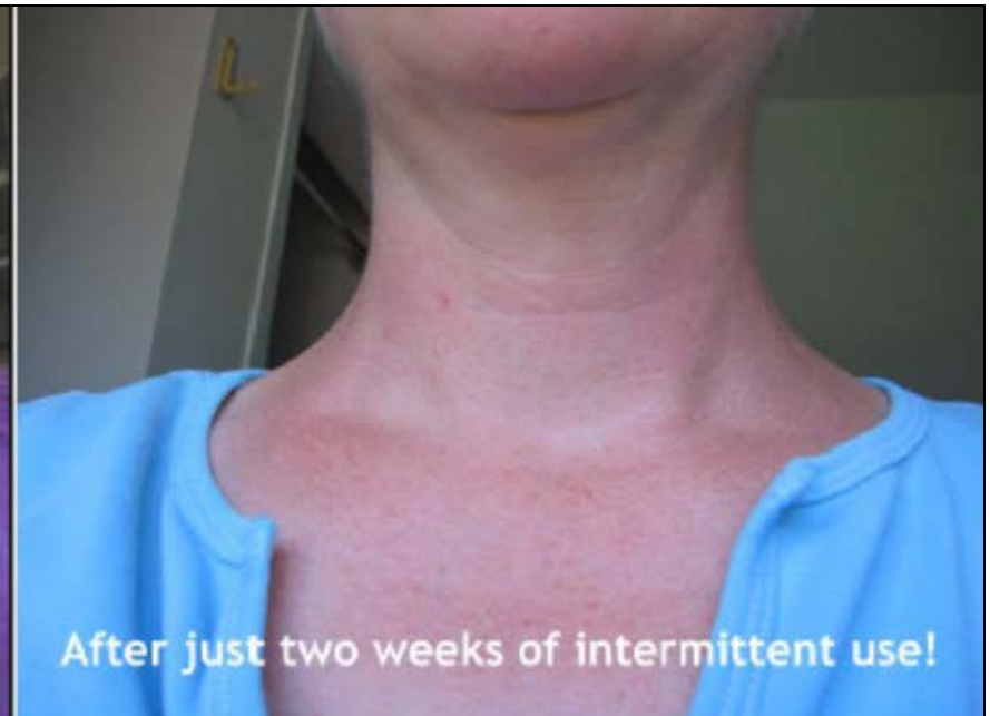
After just two weeks of intermittent use!