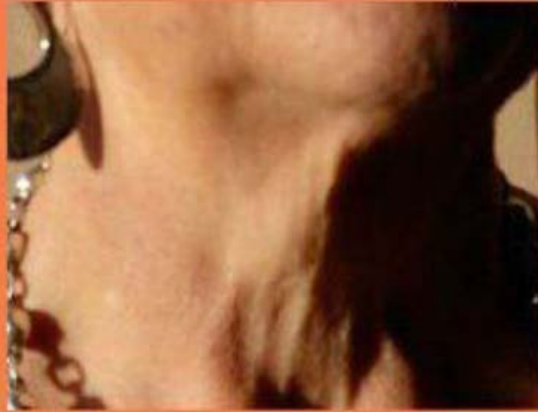
Day 21 of using Arbonne's RE9 Advanced Age-Defying Neck Cream. You cannot argue with these results...or this very happy client!!!