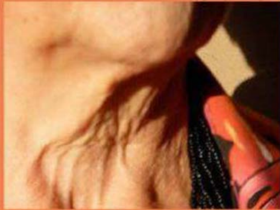
Day 1 of using Arbonne's RE9 Advanced Age-Defying Neck Cream.