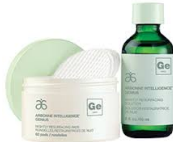
Genius World's 1 st Botanical Retinoid

Everything You Need For Anti-Aging Skin Health Care!