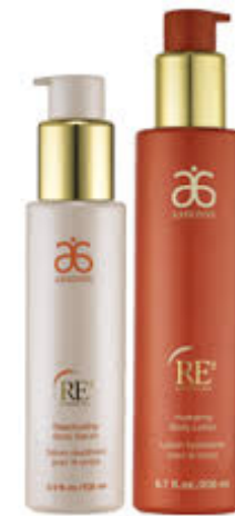
Re9 Body Serum & Lotion

(Got results TWICE as fast when this supplement was added to the Re9 Skin Care)