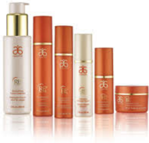
Re9 Anti-Aging Skin Care Set