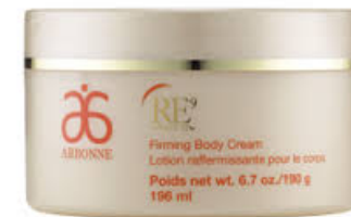
Re9 Body Firming Cream