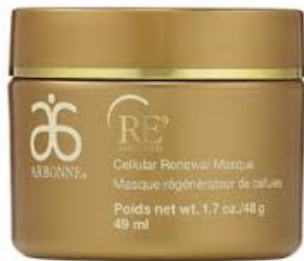
Re9 Cellular Renewal Mask