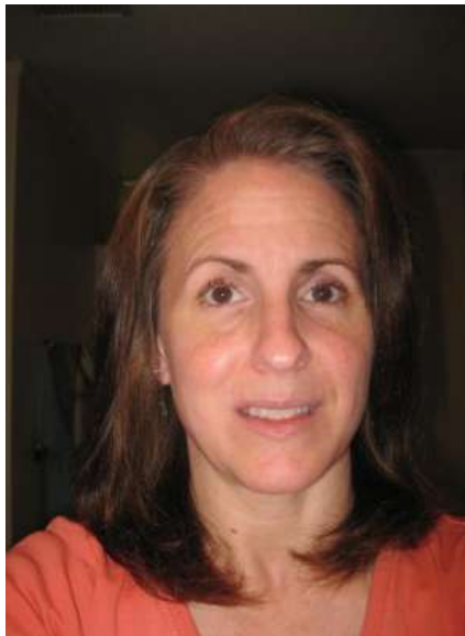
DAY 4 ALSO USED DETOX HAIR MASK