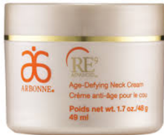
Re9 Neck Cream