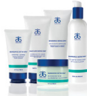
Bath & Body / Spa Experience