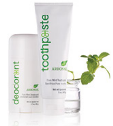
Deodorant & Toothpaste