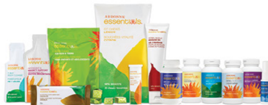
Nutrition & Wellness