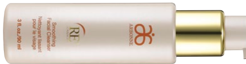
RE9 Advanced Smoothing Facial Cleanser

Four of Arbonne's top-selling products are from the RE9 Advanced line!